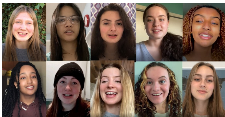
RECOGNIZED FOR EXCELLENCE IN MATH