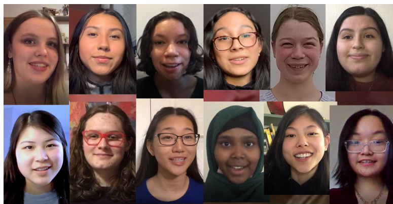
RECOGNIZED FOR EXCELLENCE IN SCIENCE