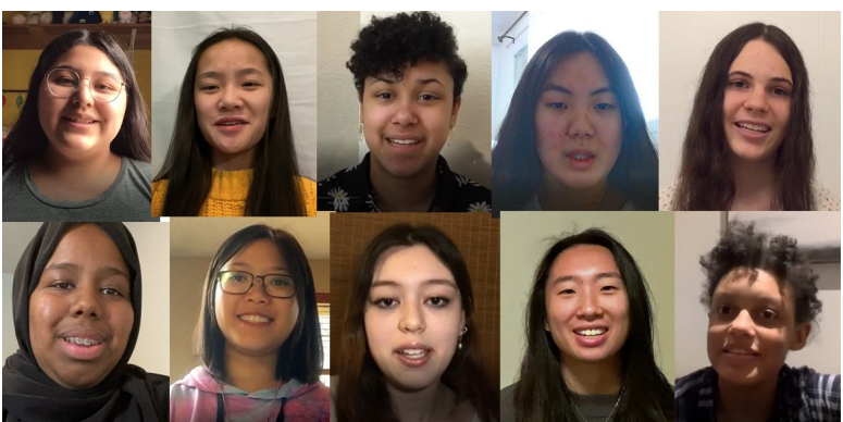
RECOGNIZED FOR EXCELLENCE IN TECHNOLOGY