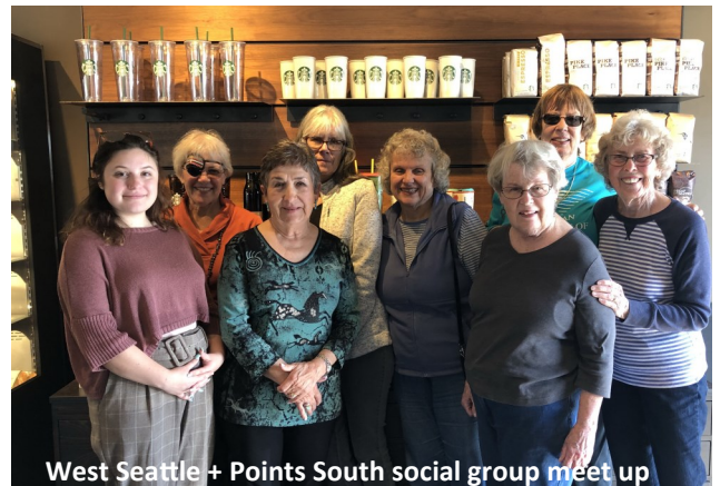
West Seattle + Points South social group meet up

Contact the hosts for more details. You may attend any group you wish.