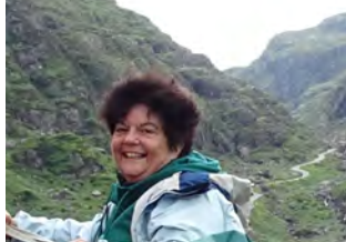
Gap of Dunloe in Killarney