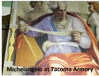
Michelangelo at Tacoma Armory

Sistine Chapel. This month we stayed closer to home and went to the new Nordic Museum in Ballard. After eating a really delicious lunch of various Scandinavian treats, we had a great time roaming through the huge collection of Nordic artifacts in five galleries. We were a few days early for the next exhibit "The Vikings Begin," which will run from October 20 - April 14, but that will be a good