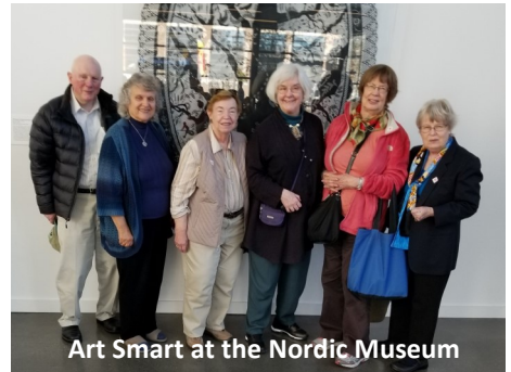
Art Smart at the Nordic Museum

The Book Group will return to the world of fiction for our meeting on November 27 th . New members are always welcome. We will be reading The Round House by Louise Erdrich, which is a tale of a boy on the Ojibwa reservation seeking justice. There will be no meeting in December, but for our January 22 nd we'll be reading Radium Girls by Kate Moore. We're now compiling the list of books from which we'll select next year's book list, so all suggestions are welcome. We meet at 1:00 on the fourth Tuesday in the Stadler Room at the Lake Forest Park Town Center, 17171 Bothell Way NE, Seattle.