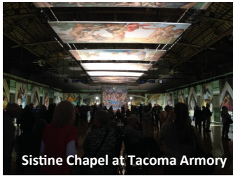
Sistine Chapel at Tacoma Armory

The Art Smart interest group is off to a roaring start. As reported last month, in September we traveled to Tacoma for lunch and a visit to see the magnificent touring exhibit of reproductions from Michelangelo's