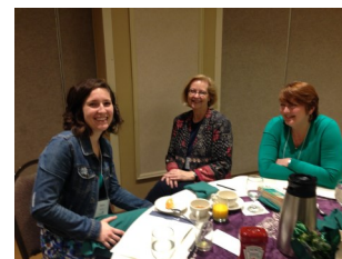
Small group conversation

change?" Every table engaged in lively conversation for each topic and, when time was up, they each shared their results with the entire group. The results were documented on large sheets of paper and post-its and hung on the walls around the room. Conversations on the topics and their results were being held even after the meeting ended!