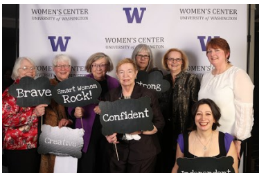
AAUW Seattle members at the Gala.