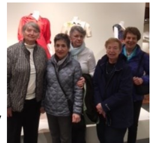
The Art Smart Bunch