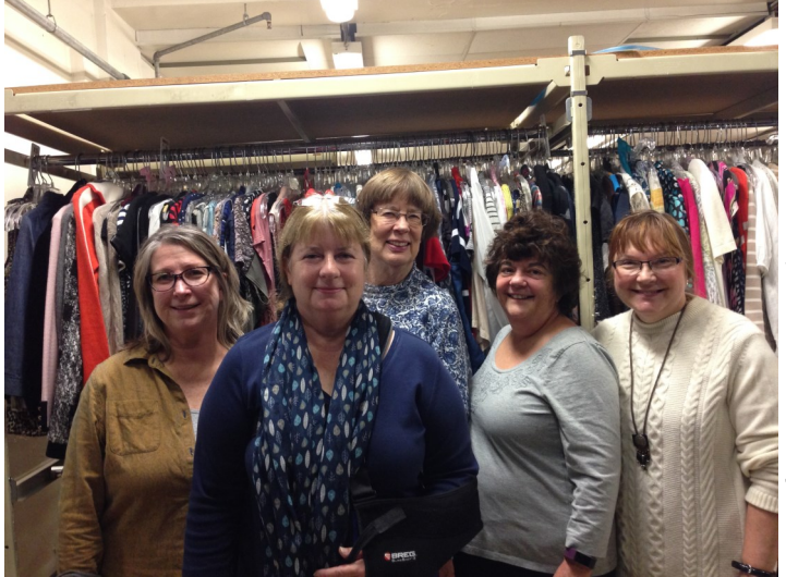
AAUW Seattle Volunteers

employment opportunity. Back to work, our final tasks were to go thru all the racks checking sizes and tagging the clothes with "tagging guns". We were preparing special clothes for a December 15-16th sale to benefit the Dress for Success program. We had a lot of fun and the two hours flew by.